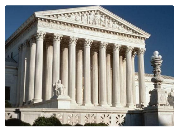
U.S. Supreme Court