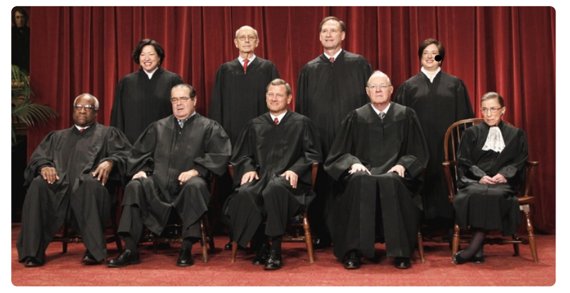
Supreme Court Justices

What are the consequences of not following the laws?